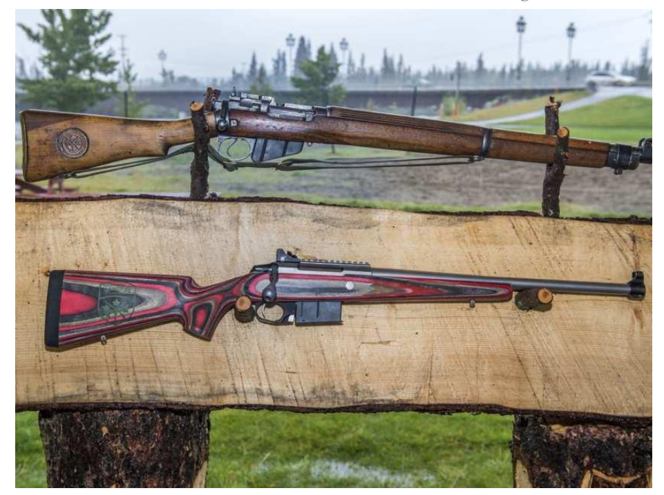
The new Canadian Ranger Rifle underneath the Lee Enfield, the weapon it will replace.