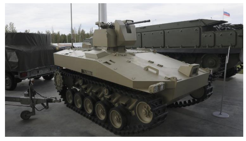
Soratnik is intended to provide direct support to infantry.