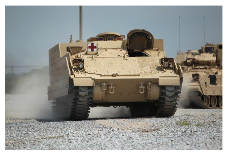
The first Armored Multi-Purpose Vehicle, or AMPV, is scheduled to be handed over to the Army Dec. 15, 2016, for testing.

WASHINGTON (Army News Service) -- The first armored multipurpose Vehicle, or AMPV, is scheduled to be handed over to the Army Thursday for testing. The AMPV demonstrator will roll out of the BAE Systems plant in York,