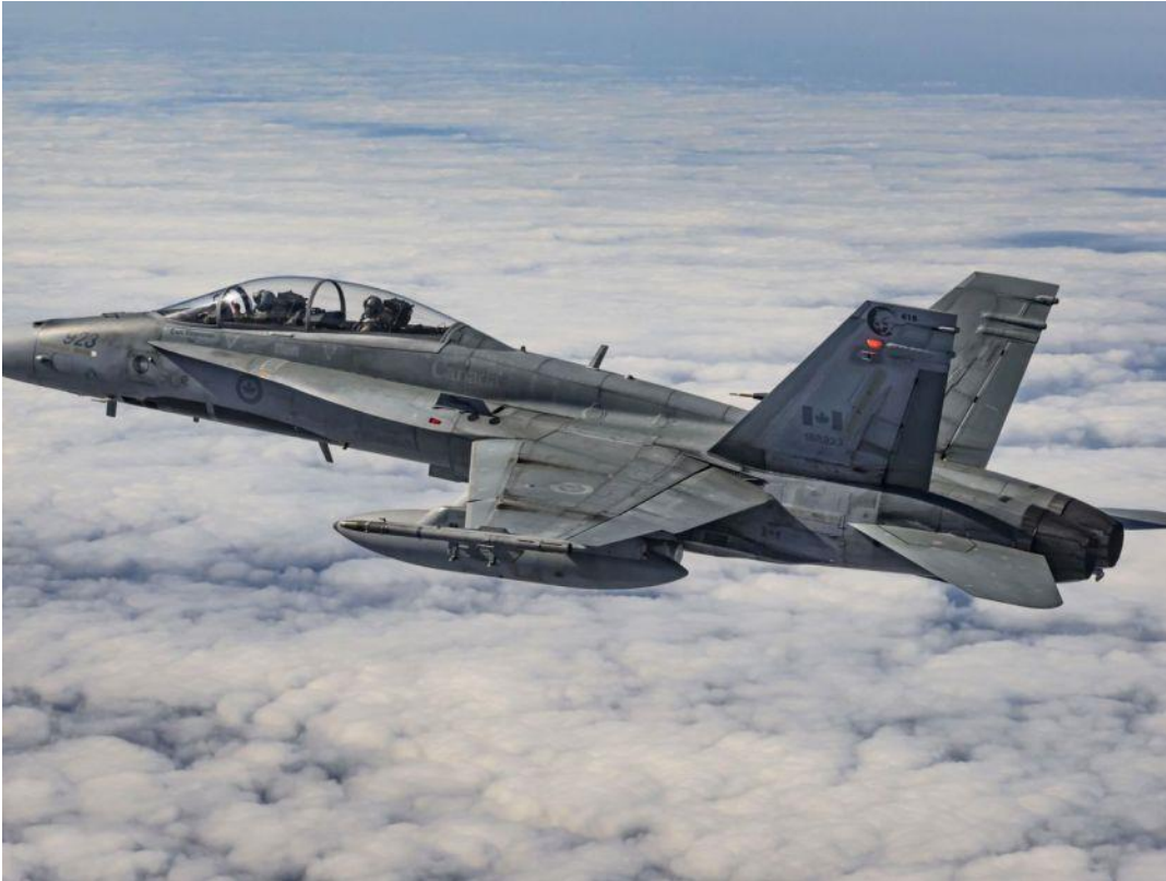
A Royal Canadian Air Force CF-188 Hornet departs Marine Corps Air Station Miramar, California to conduct a mission as part of Exercise PUMA STRIKE 16-B on November 16, 2016.

The exact cost of purchasing the 25 aircraft, along with weapons and other equipment is not yet known as negotiations are still underway on the deal, Procurement Minister Carla Qualtrough recently told journalists. The Liberal government has set aside up to $500 million for the project. An Australian Senate hearing was recently told that Canada was presented with a cost proposal from the Australian government last year. “They accepted our offer in December, but they have also put in a further request for some seven aircraft for system testing, training and spares,” Australian Air Vice Marshal Cath Roberts told the hearing. The US government is examining the deal and will have to give its approval to Australia before that country can sell the F-18s to Canada. Approval is needed because the F-18s were built in the US with American technology. Canada is hoping for the US approval sometime in the summer.