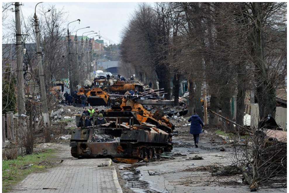
Destroyed Russian tanks in Bucha, Ukraine, on April 4.

It's true that just two dozen Ukrainian volunteers, armed with Kalashnikovs, hunting rifles and Soviet-era grenade