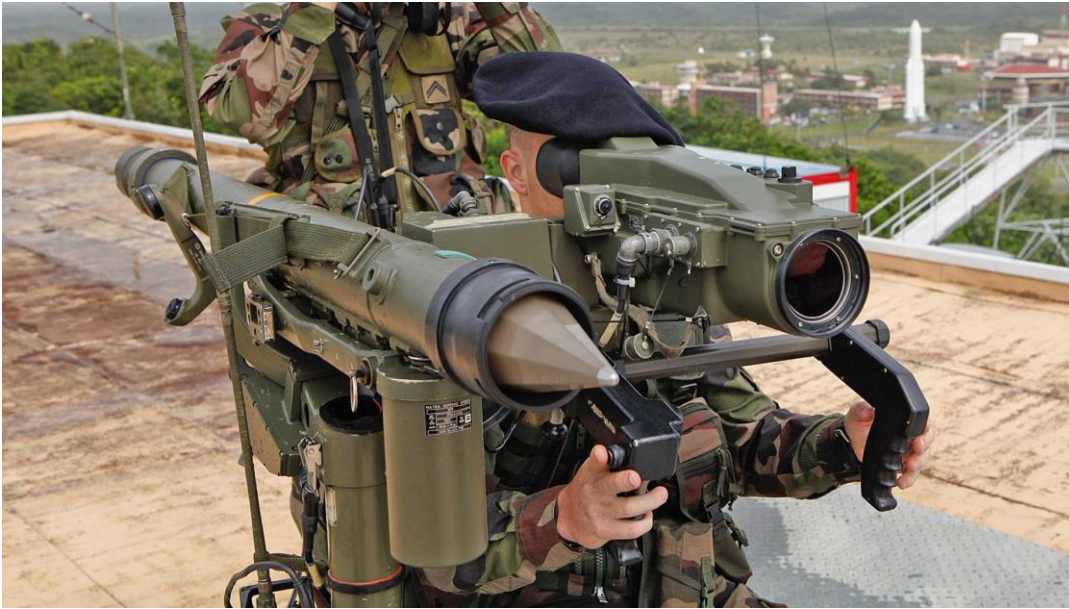
French Forces in Guyana with a Mistral launcher. This one is equipped with a thermal optic.

foundation then began supporting Ukrainian forces by fundraising money to deliver supplies and technologies ranging from bulletproof vests to thermal optics. With the delivery of the Fiat Fullbacks, Come Back Alive hopes to promote the implementation of ‘mobile fire groups’ equipped with the French-made Mistral launchers to help address the looming aerial threat posed by Russian forces. The MBDA-produced Mistral is a heat-seeking, short-range MANPADS ideal for use against aerial targets like unmanned aerial vehicles, or UAVs, as well as fixed-wing and rotary-wing aircraft. The Mistral missiles Norway donated actually came from the country’s Navy, but they were supplied from portable seated launch systems that could be used on land. Considering they are not quite as mobile as other MANPADS, this likely prompted their installation in the beds of pickup trucks, turning them into something akin to technical-based SAM systems.