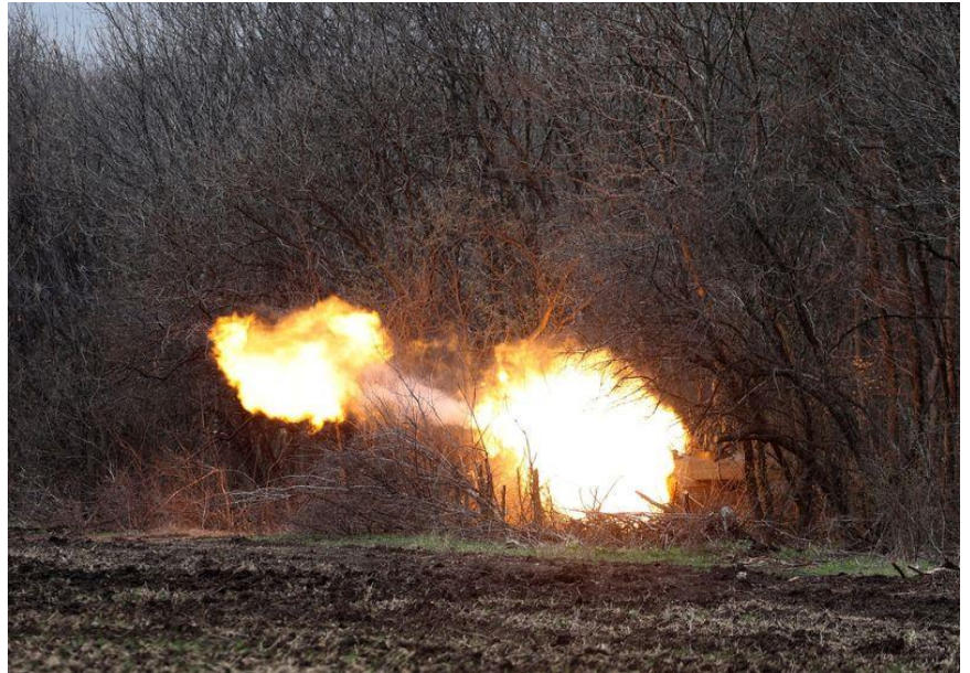
Ukrainian artillery hits Russian troop positions near Lysychansk in the Luhansk region, Ukraine, on April 12.

Artillery, said a Moscow-based military analyst who asked not to be named due to restrictions in Russia on media freedom, was also decisive in the brief 2020 conflict between Azerbaijan and Armenia. Commentary in the US and elsewhere focused on Turkish-made drones that Azerbaijan's forces used to destroy Armenian tanks from the air. But long-range artillery directed by surveillance drones did most damage, the person said. Armenia lacked drones and its Soviet-era artillery was still operating the same way as in World War II, marking out squares on a map to saturate with fire in the hope of eventually hitting the opposition, according to the analyst. The more targeted Azerbaijani fire took a terrible toll among trained Armenian artillerymen. Russia often still uses those old school methods, said the analyst. Although it has drones, they use Russia's generally less accurate Glonass positioning system, rather than the US GPS satellite network for targeting, while the drones and Russian artillery have weaker connectivity, he said. It may yet be enough, especially if Russian forces can break