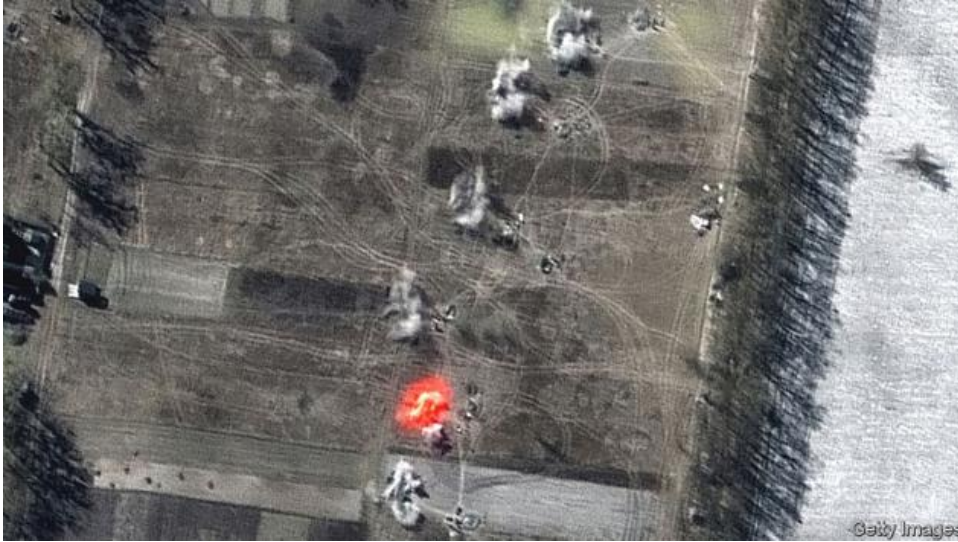
Russian convoy under artillery attack