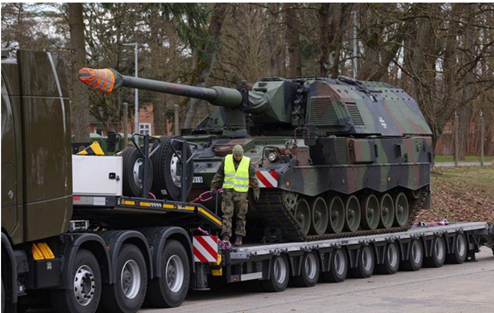
A Pzh 2000 gun.

through before Ukraine takes delivery of the more modern, longer range artillery that's on its way — a supply line Russia is working hard to interdict with missile strikes.