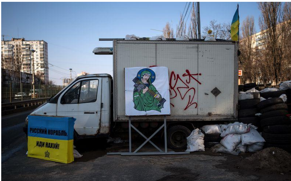
A banner with an image known as 'Saint Javelin' depicting a saint holding a Javelin portable anti-tank missile system, at a check point in Kyiv, Ukraine.