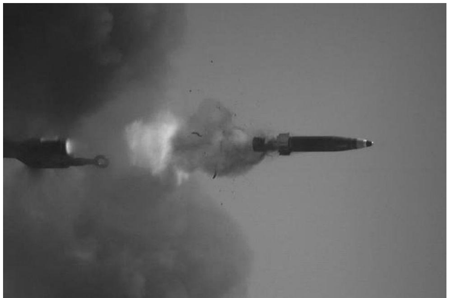
Raytheon Company's new laser-guided Excalibur S 155mm artillery round secret, live-fire test for the Marine Corps last spring at Yuma Proving Ground, Arizona.

The Marine Corps is interested in the Excalibur S round but "has not currently placed an order," he said.