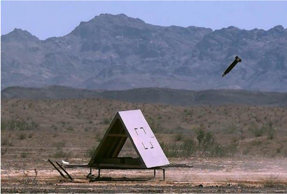
Raytheon Company's new laser-guided Excalibur S 155mm artillery round scored direct hits on a moving target in a secret, live-fire test for the Marine Corps last spring at Yuma Proving Ground, Arizona.