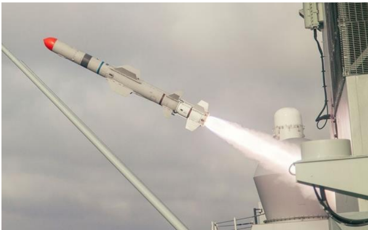
A Harpoon Block II surface-to-surface missile is launched from HMCS Vancouver toward shore targets during a Joint Littoral Training Exercise between the Royal Canadian Navy and U.S. navy at a missile firing range off the coast of California.

During the NATO led mission in Libya, HMCS Charlottetown patrolled the Mediterranean coast. On May 30, 2011, it came under rocket attack, although the ship wasn't damaged and none of the crew was injured. Sloan suggested that if the NATO coalition had more precision-guided weapons such as the Harpoon Block II at its disposal during the Libya campaign, the conflict might have been resolved in the summer of 2011 rather than October of that year. The new missile system gives the navy the ability to defend itself when attacked, in what naval planners call littoral warfare — conflicts in the coastal regions of the world.