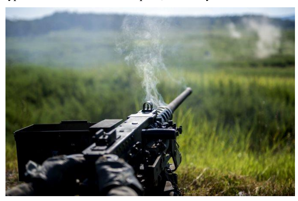
The US Army will soon begin to produce wireless, crew-served thermal weapons sights that connect to a soldier's helmet display.

Using a wireless link, gun-mounted thermal sights send a targeting reticle from the gun to a soldier head-worn display, allowing soldiers to hit targets without needing to physically "look" through the gun-sights themselves in a certain physical position. The US Army will soon begin to produce new high-tech, crew-served thermal weapons sights able to automatically adjust range, see through adverse weather, detect targets with a lightweight laser range finder and use a wireless targeting link between weapons and a soldier-worn helmet display, service officials said. Designed for the M2 .50-cal, M240 machine gun and Mk 19 grenade launcher, the system brings higher-resolution thermal imaging technology and increases field of view, developers explained. "This is the first time the soldier will have a system which combines a true day and night capability with a laser range finder to adjust for the ballistics of the various ammunition types for the crew served weapons," an Army official told Scout Warrior.