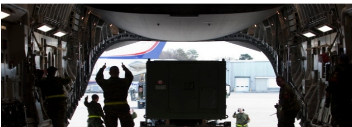
A container is loaded on a military plane.