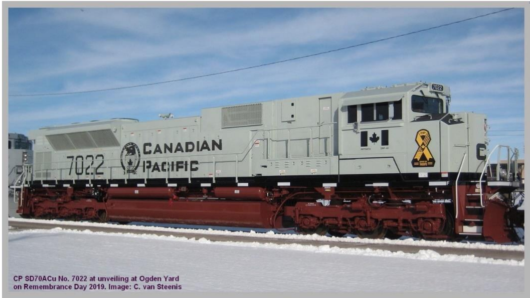
CP 7022 wears the grey, red and black colour pattern of modern Canadian and American warships.

CP 7023 wears a two-tone gray paint scheme designed after the livery applied to Canadian and American fighter jets.