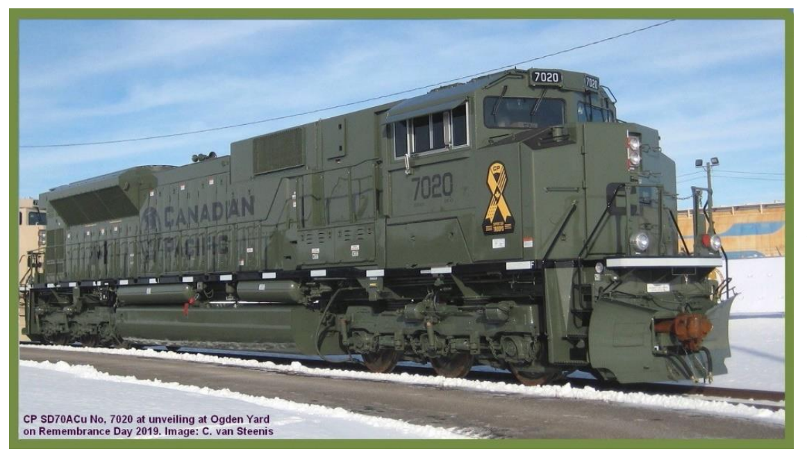
CP 7020 wears NATO green, which the Canadian and US armies apply to fighting vehicles and equipment serving in temperate climates.

CALGARY/PRNewswire/ - Canadian Pacific (CP) unveiled five specially painted locomotives on Remembrance Day in Canada and Veterans Day in the U.S. honouring the culture and history of the armed forces. The five Electro-Motive Diesel SD70ACUs will take the message of military pride across the CP system. "As a leading employer of veterans, CP is proud to commemorate military machines and the brave men and women who've operated them in conflicts around the world," said CP President, CEO and veteran Keith Creel. "As these locomotives pass through communities across the CP system, I hope those who see them will reflect on the sacrifices made by so many of their countrymen to protect and defend their freedom." CP personnel carefully studied the paint colours and patterns that branches of the Canadian and US militaries applied to tanks, planes and warships. Based on their research, they devised five liveries for these locomotives: