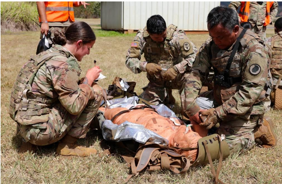
US Army combat medics assess simulated casualties after moving to a safe area during training at Schofield Barracks, Hawaii, June 13, 2022.