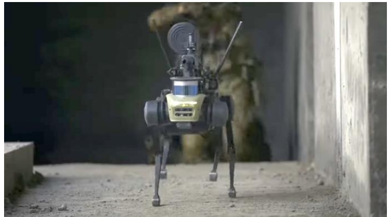
A Kestrel Defense armed robot dog patrol with ground forces.

Details regarding the exact systems featured in the new Kestrel Defense video are scant.