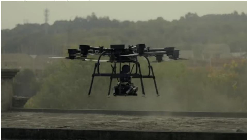
A Kestrel Defense robot dog get dropped off on a rooftop.

In a future war, death may not arrive by helicopter or tank, but with the gentle whir of electric rotors and the metallic patter of robotic paws. That's the inevitable takeaway from a video that recently circulated on Chinese social media that shows a drone deploying a quadrupedal unmanned ground vehicle (Q-UGV) — or “robot dog,” if you're into the whole brevity thing — armed with a light machine gun onto a rooftop. The video was shared by a verified Weibo account named “Kestrel Defense Blood-Wing” which appears to be affiliated with the Chinese defense contractor Kestrel Defense. The footage shows a medium-sized drone hauling a folded-up robot dog on approach to a building in a dense urban area before releasing its robotic payload on the rooftop and flying away.