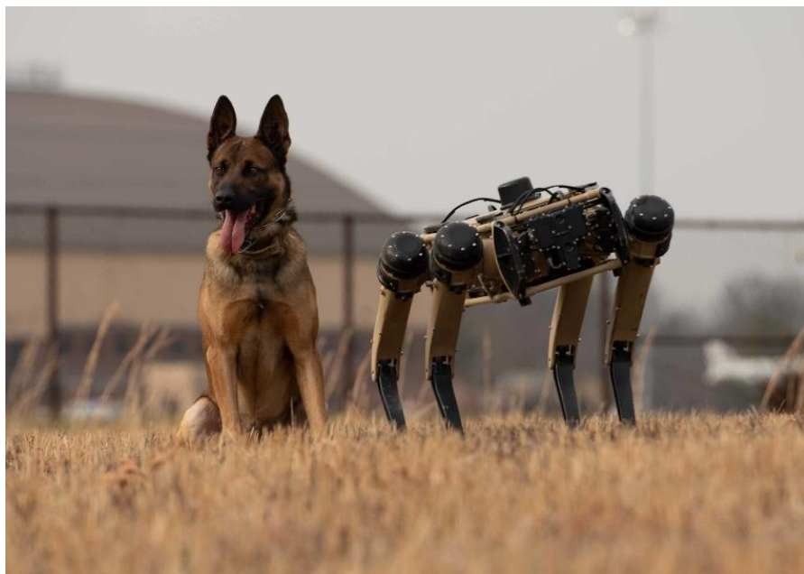
Hammer, 375 th Security Forces Squadron military working dog, sits next to the Ghost Robotics Vision 60 at Scott Air Force Base, Ill, Dec. 17, 2020.