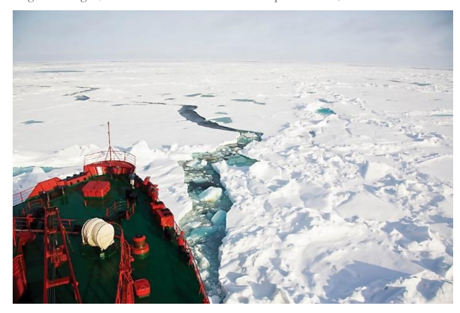
A Russian nuclear icebreaker plows through pack ice in the Arctic, north of Franz Josef Land, Russia.