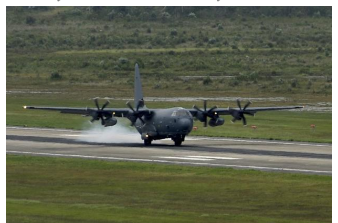
An MC-130J Commando II lands on the flightline at Hurlburt Field, Fla., Aug 11, 2016. The AC-130J Ghostrider is a modified version of the MC-130J.

The Air Force has received an upgraded version of its Ghostrider gunship. The 4<sup>th</sup> Special Operations