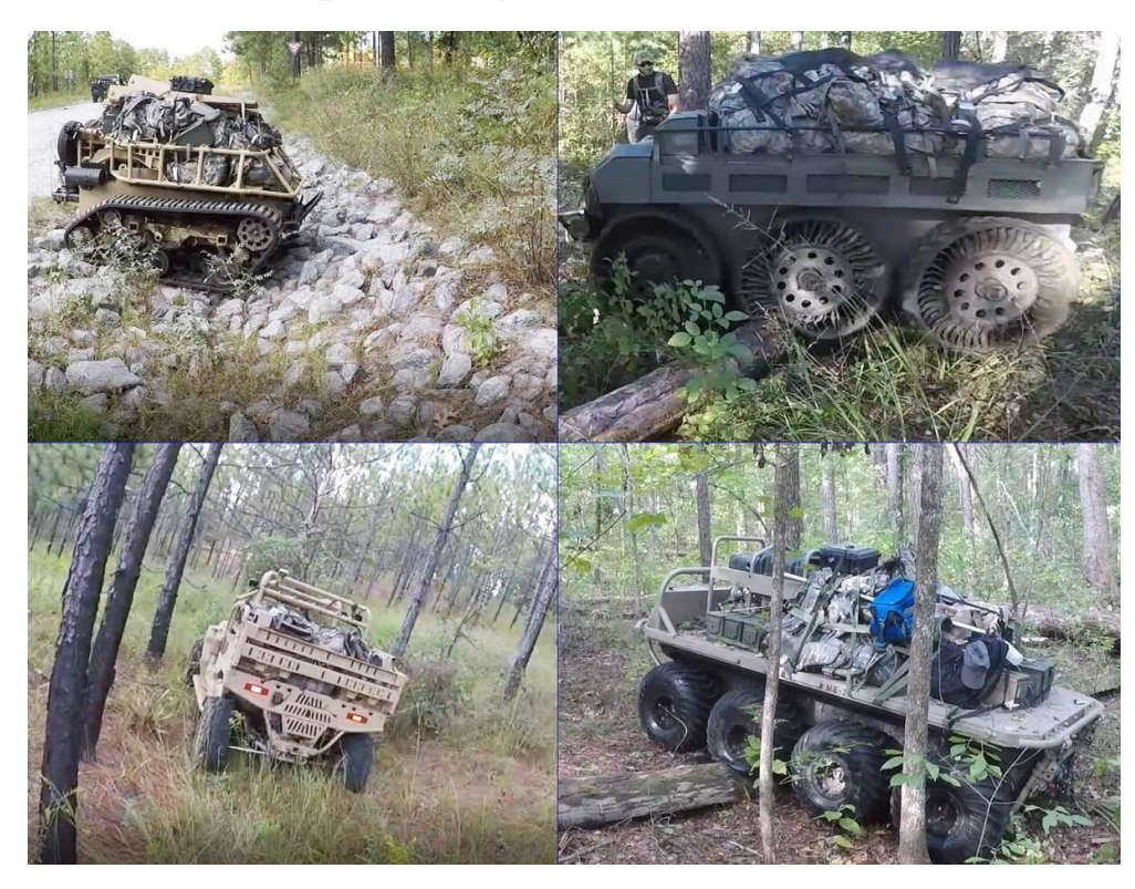
The Army plans to award a contract in June 2020 to produce hundreds of robotic mules that will help light infantry units carry gear.

It will haul 1,000 pounds of gear. Jared Keller Jun 8, 2020