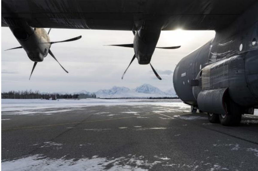
A CC-130J Hercules from 436 Squadron on the flight line at Fort Greely, Alaska, before a static line jump with US paratroopers during Arctic Edge on Feb 29, 2020.