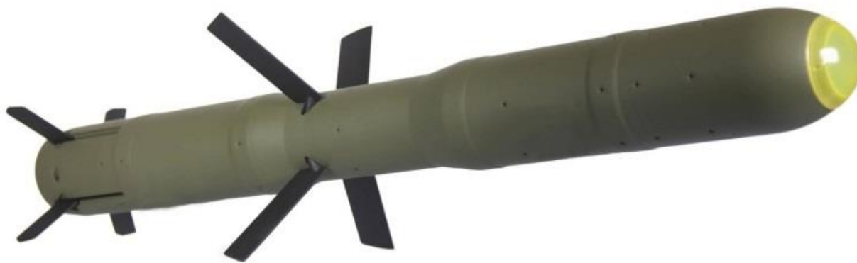
Raytheon's precision- guided Carl Gustaf recoilless rifle shell

The new round is just the latest upgrade to the iconic system. The M3A1 variant developed by Swedish Carl Gustaf godfather Saab Dynamics AB offers a titanium shell designed to reduce system weight and length. The M3A1 variant also offers the capability to fire off multiple salvos of specialized rounds — like, say, Raytheon’s laser-guided munition — in a departure from the one-and-done weapons like the AT-4 anti-tank system.