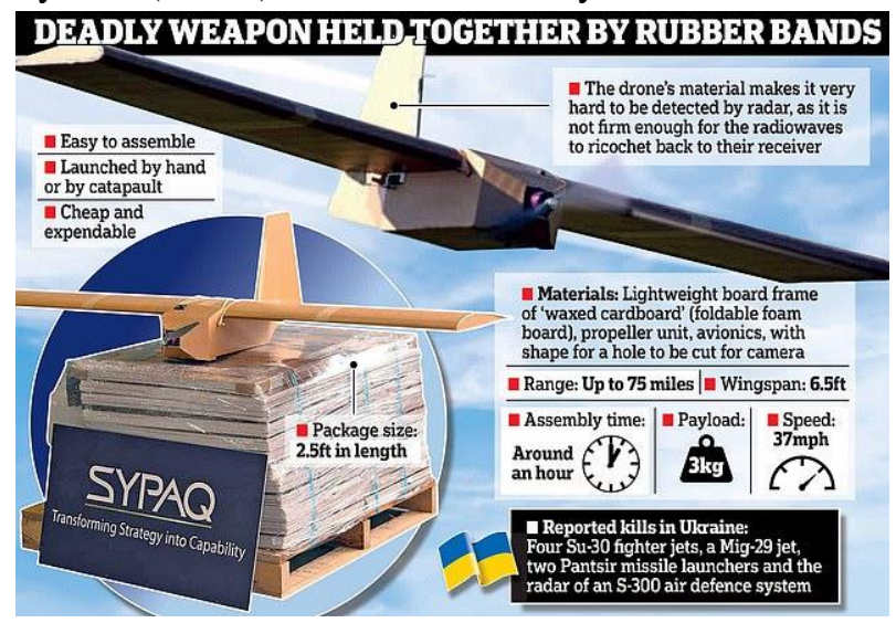
The drones, believed to be virtually undetectable by radar, can fly for 75 miles at 37mph and are capable of carrying up to 3kg of load

Cardboard drones as easy to assemble as an Ikea flatpack are believed to have destroyed five Russian jets in an attack by Ukrainian forces. An official from Kyiv's security service said four Su-30 aircraft and one Mig-29 fighter jet were hit at Kursk airfield just across the border in Russia. Last weekend's assault, said to have involved 16 drones, also damaged two Pantsir missile launchers and the radar of an S-300 air defence system. A prominent pro-Russian blogger reported that, 'for the first time', cardboard self-assembly drones sold to Ukraine by Australia were central to the operation. The weaponry is called the Corvo Precision Payload Delivery System (PPDS) and was created by Australian manufacturers Sypaq.