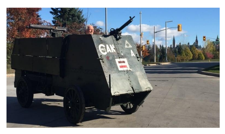
The restored 1913 model Autocar Armoured Car CBC News