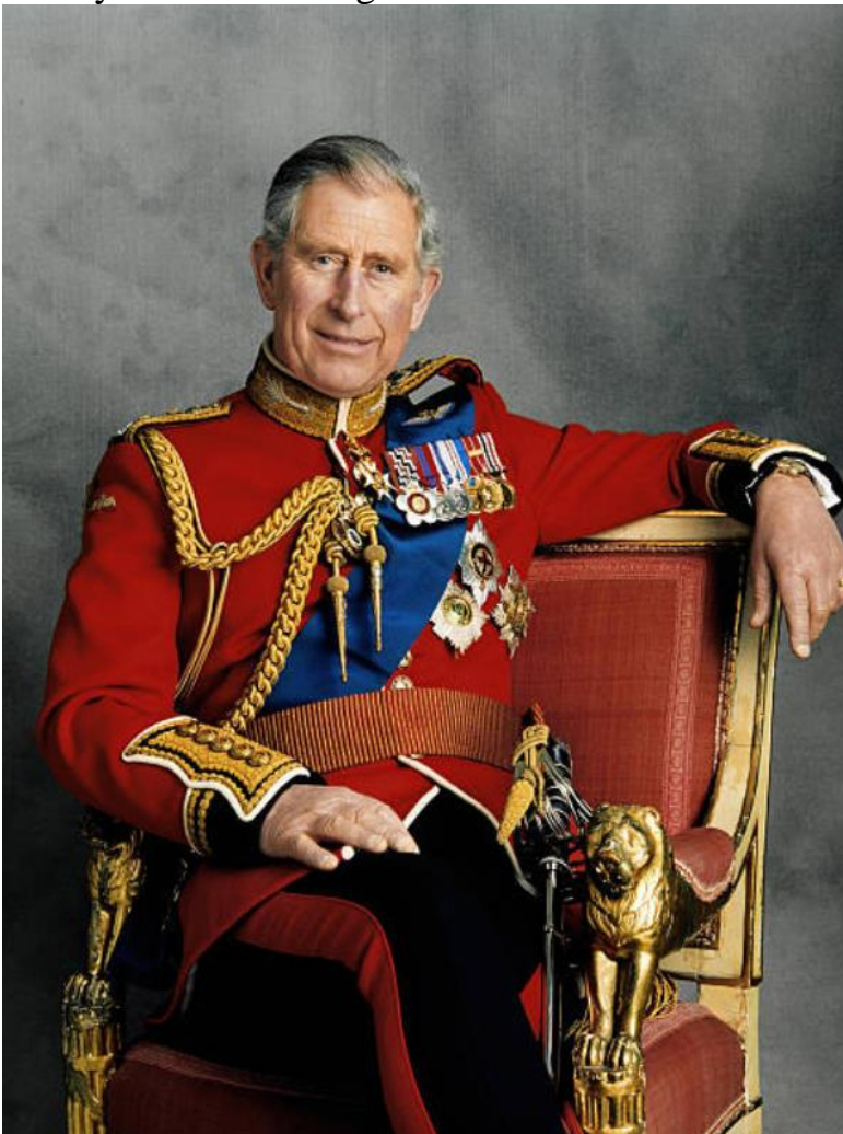
LONDON, NOVEMBER 13: King Charles III, poses for an official portrait to mark his 60th birthday, photo taken on November 13, 2008 in London, England.

With the grandeur that is to be expected, King Charles III was officially proclaimed sovereign of the United Kingdom of Great Britain and Northern Ireland in a ceremony that dates back hundreds of years. The ceremony, which took place Saturday, Sept 10, 2022, at St James’s Palace in London, called upon the Accession Council to acknowledge the new monarch on behalf of the British government, a process carried out according to the constitution. With this declaration, King Charles is now not only the sovereign of the United Kingdom but also the head of the Commonwealth, which comprises 2.4 billion people and 54 countries. Now the world’s eyes will be on Charles, who, at 73, becomes the oldest, and arguably the most groomed, person in British history to become king.