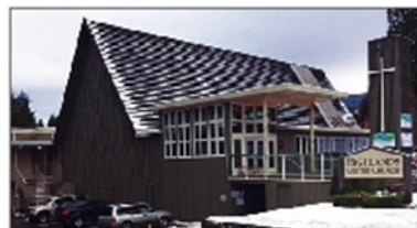
Highlands United Church Phone: (604) 980-6071