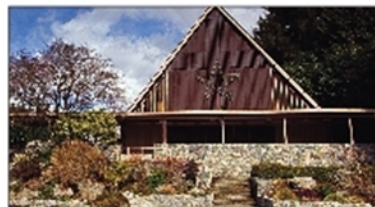
St. Catherine's Anglican Church Phone: (604) 985-0666