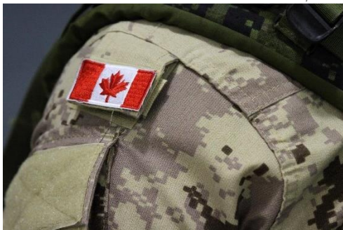
A Canadian flag is shown on a member of Canadian forces who are leaving from CFB Trenton, in Trenton, Ont., on October 16, 2014.