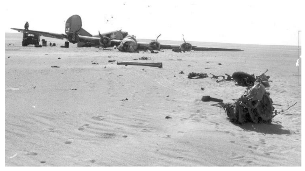
Aircraft parts were strewn by the Consolidated B-24D Lady Be Good as it skidded to a halt amid the otherwise emptiness of the desert.

16 miles, descending along a shallow trajectory and hitting the ground relatively gently. A search and rescue mission was launched but did not find the aircraft or its crew. It was assumed that Lady Be Good had crashed into the Mediterranean Sea. Its loss was a mystery.