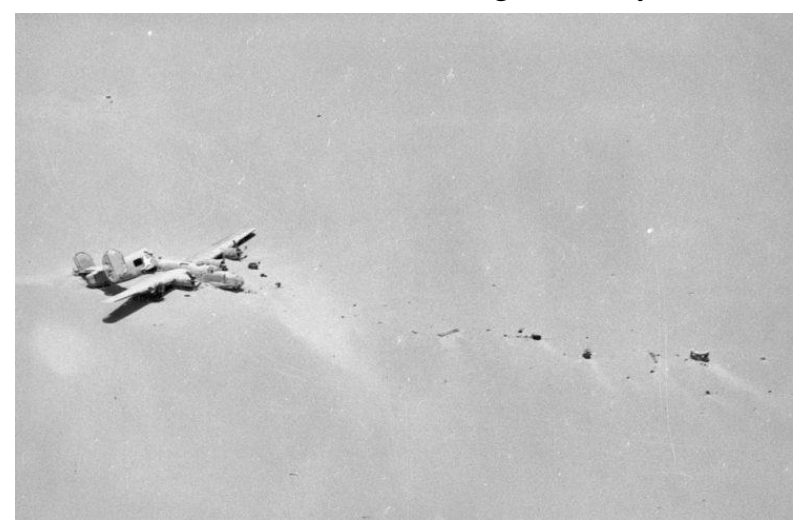
The Consolidated B-24D Lady Be Good as it appeared when discovered from the air in the Libyan desert.

over Naples. The aircraft seemingly vanished into thin air. In 1958 a British oil exploration team discovered the wreckage of a large aircraft laying in the Libyan Desert. Upon closer inspection, it was revealed to be the wreckage of Lady Be Good that went missing 15 years before.