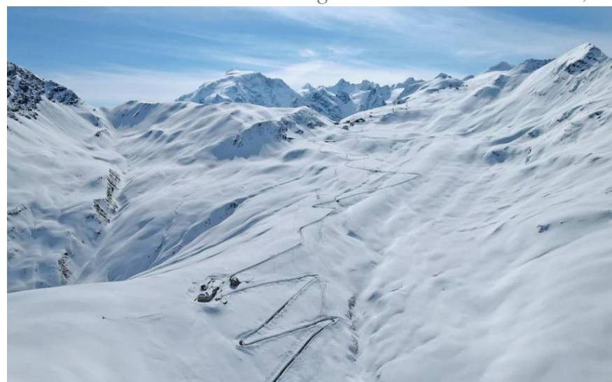
Stelvio Pass area and in the background the glaciers of the Ortles-Cevedale group, Italy.

Adela Suliman The Washington Post November 13, 2021