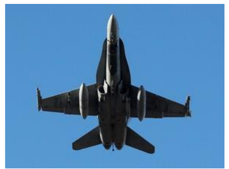
The Royal Canadian Air Force currently uses the CF-18 jet.