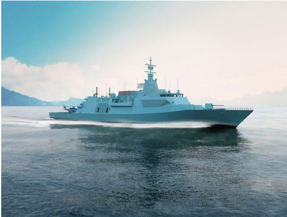
The Type 26 Global Combat Ship