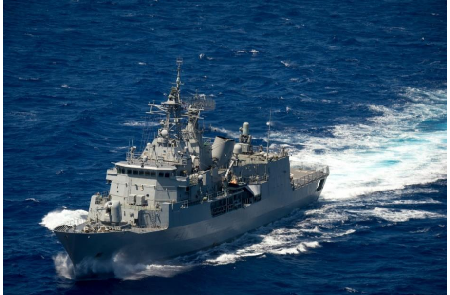
RNZN Te Kaha during Exercise 'Rim of the Pacific 2016'.