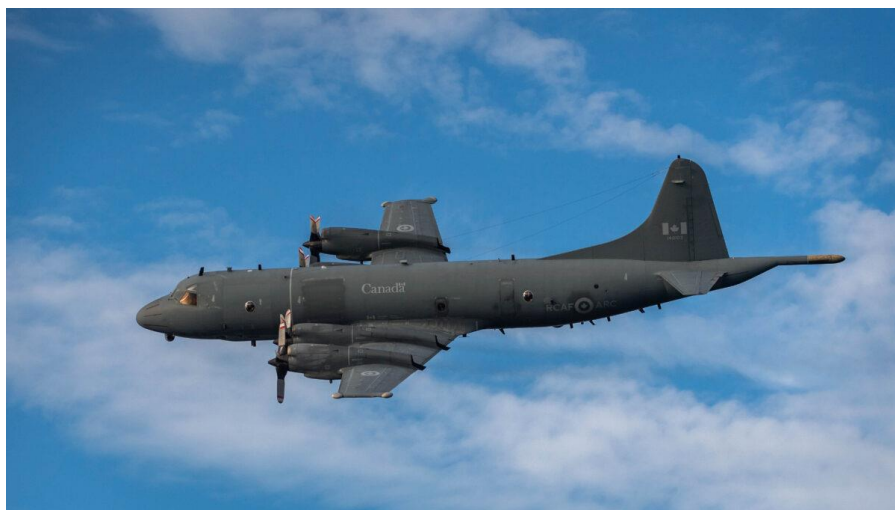
A CP-140 Aurora aircraft flies over HMCS GLACE BAY during Operation NANOOK 2020 on August 21, 2020.

$12.5-million Contract. Vanguard Staff, December 30, 2021