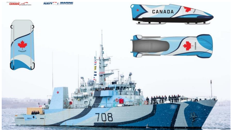
The Canadian bobsled and skeleton designs pictured with coastal defence vessel HMCS Moncton. (Bobsled Canada Skeleton)

commemorative dazzle paint scheme in 2020 to mark the 75 th anniversary of the end of the Battle of the Atlantic. The battle was the longest fight of the Second World War, in which dozens of Canadian ships were sunk by German vessels in the struggle for control over the North Atlantic from 1939 to 1945.