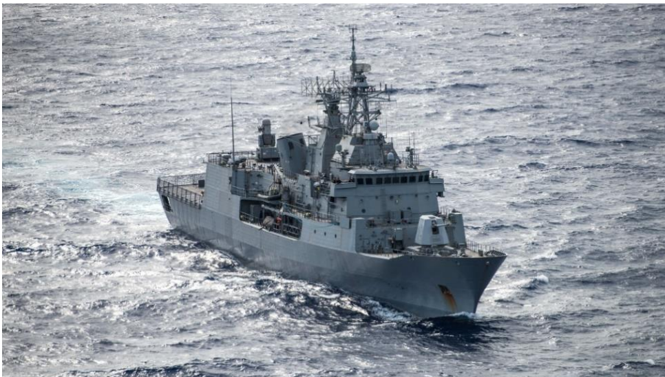
RNZN Frigate Te Mana transits the Pacific Ocean on July 24, 2018.