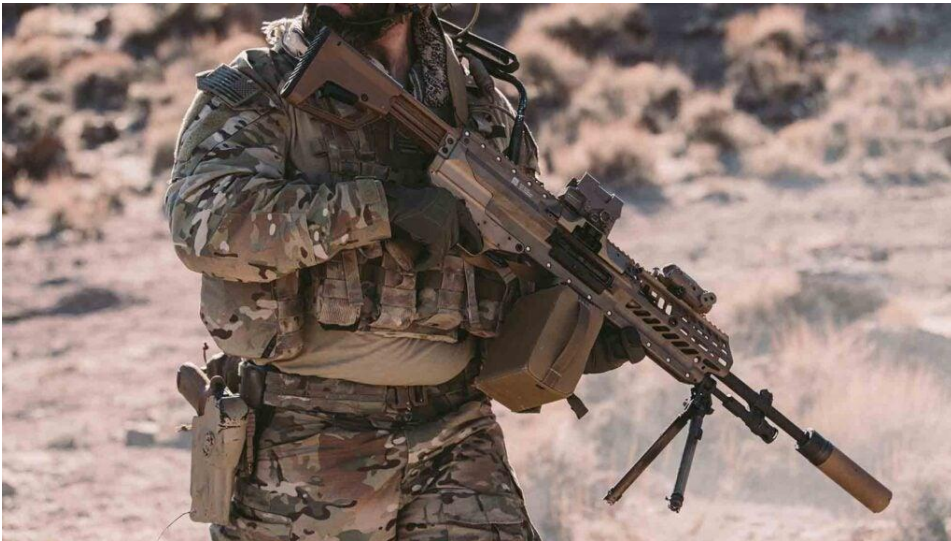
Sig Sauer’s submission for the Army’s Next Generation Squad Weapon light machine gun weighs 12 pounds and has an effective range of greater than 1,000 meters.

the M240 machine gun, which chambers 7.62 mm rounds. Following a 2017 study into small arms ammunition, the Army decided that the Next Generation Squad Weapon needed to fire a 6.8 mm round to penetrate enemy body armor. Gen Mark Milley, then Army chief of staff, told Congress in May 2017 that body armor as cheap as $250 could stop the 5.56 mm rounds fired by the M4 and M249. Burris declined to say on Wednesday if the 6.8 mm round could penetrate Level IV armor plates, the highest rifle plating under National Institute for Justice body armor standards. “I can’t get into specifics of what capability it provides, but it does provide greater energy against protected and non-protected targets at various ranges,” Burris said. “I can’t really go into the rest of it. It’s a much greater capability.”