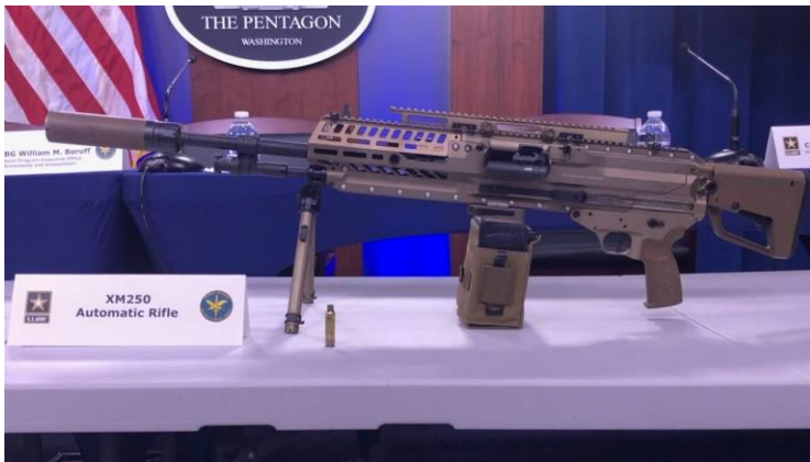
The Next Generation Squad Weapon on display during a Pentagon news conference.