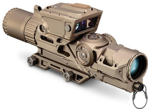
The 1-8x30 Active Reticle Fire Control from Vortex Optics (Vortex Optics)

US Army modernization officials have selected a Wisconsin-based optics firm to make advanced fire-control prototypes capable of equipping the service's Next Generation Squad Weapon (NGSW) with a 1,000-meter laser range finder and a ballistic computer to calculate the bullet's path to the target, according to an April 20 news release from Vortex Optics. The Army's Product Manager Soldier Lethality awarded Vortex an agreement to deliver production-ready prototypes of the NGSW-Fire Control for future Soldier Touch Point evaluations, the release states. The 1-8x30 Active Reticle Fire Control is a variable power, direct-view, first focal plane riflescope -- meaning that the reticle is located in front of the magnification lens to allow the reticle to increase in size as the shooter increases the magnification level. The Vortex system is built around "a revolutionary technology based on many years of internal research and development, along with multiple cooperative development efforts with the Army's [Project Manager] Soldier Weapons," according to the release. "The end result is Active Reticle, which has been proven to increase hit percentage and decrease time to engage during US Army Soldier touchpoints over the last two years," it adds.