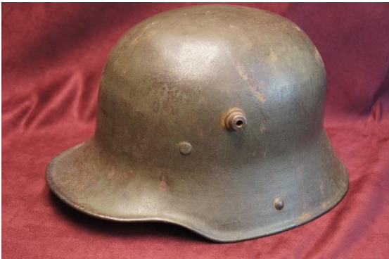
The German 1916 Stahlhelm helmet was designed after existing Allied versions were assessed.

In what is believed to be the first study of its kind, the helmets were mounted on sensor-equipped dummy heads and aligned with a cylindrical shock tube to simulate an overhead blast. A bare-headed test was also conducted. The team then generated primary blast waves of different magnitudes based on estimated blasts from historical shells. Peak reflected overpressure at the open end of the blast tube was compared to measurements at several head locations. “All helmets provided significant pressure attenuation compared to the no-helmet case,” said their paper, published Feb 13 in the online journal Plos One . “The modern variant did not provide more pressure attenuation than the historical helmets, and some historical helmets performed better at certain measurement locations. “The study demonstrates that both historical and current helmets have some primary blast protective capabilities, and that simple design features may improve these capabilities for future helmet systems.”