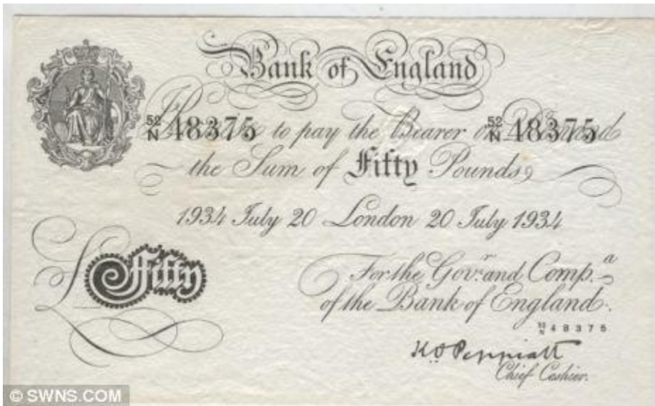
Bullseye: Perfect forgery of a £50 note produced by expert counterfeiters in Germany recovered from a lake in Austria

Britain and to flood the economy with the fake money. But Hitler's plan was foiled when British spies got wind of the idea and intercepted the shipment of the notes. The Bank of England first learned of a plot from a spy as early as 1939. It first came across the actual notes in 1943 and declared them 'the most dangerous ever seen.' The initial plan was to destabilize the British economy by dropping the notes from aircraft, but Hermann Goering's Luftwaffe declared it did not have enough planes to deliver the forgeries, and the assets were put in the hands of SS foreign intelligence, which were transferred from SS headquarters to a former hotel near Meran in South Tyrol, Northern Italy. From there they were laundered and used to pay for strategic imports and German secret agents operating in the Allied countries.