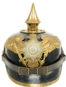
The German pickelhaube was generally made of leather.

The results suggest there is. The blast tests found that, bareheaded, the risk for mild, moderate and severe bleeding of the tissue surrounding the brain was in the 50 per cent range. All helmets subjected to the same blast conditions showed less than 10 per cent risk of moderate bleeding at the crown, with the Adrian helmet coming in at close to one per cent. “Helmets provided more shock wave attenuation at lower pressure levels than at higher pressure levels,” the scientists observed, “suggesting that helmets might play an especially important role in protection against mild primary blast induced brain trauma. “The effect of wearing a helmet, especially for short positive phase durations (0.5–5 milliseconds), is a significant reduction in risk of blast brain injury at the crown of the head for overhead blast scenarios.” The results varied for other parts of the head and ears, depending on the shape of the helmets.