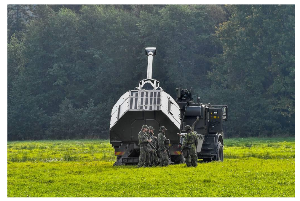
Swedish service members are seen near an Archer howitzer on Oct 14, 2017, during an exercise in the country.