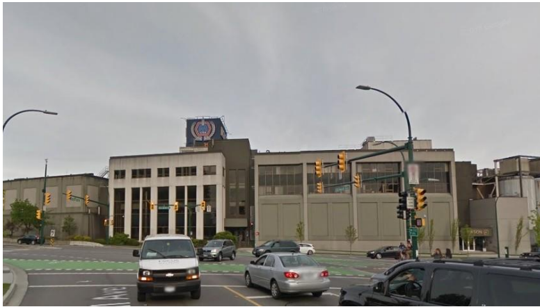
Molson Coors brewery site in Vancouver.

Warning - gunfire might be heard. The Canadian Press Nov 23, 2023