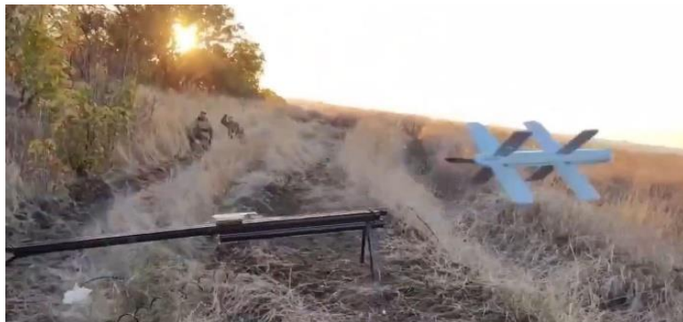
Russian troops launch a Lancet.

Russia's newest Lancet explosive drones apparently fire slugs of molten metal that can shoot right past the add-on armor Ukrainian troops count on to protect their vehicles from drone attacks. If there's any good news for the Ukrainians in the