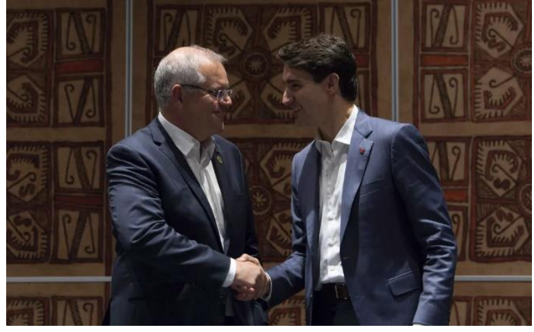
Prime Minister Justin Trudeau speaks with Australian Prime Minister Scott Morrison during a bilateral meeting at the APEC Summit in Papua New Guinea in 2018.

Managing middle power relationships with China is clearly difficult, and Canada and Australia have responded differently. Canada has tried using quiet diplomacy, but for many months, Beijing did not even answer phone calls from Ottawa. Canada hasn't demonstrated to China that there are consequences for its actions against Canadian citizens and trade because it has a longstanding policy not to retaliate against an action in one area with sanctions in another. Canadian officials fear that reprisals could spiral out of control. Furthermore, Canada has avoided taking actions that might anger China, and so still has not announced its decision on Huawei or on the listing of China's CGTN television network, which has been broadcasting forced confessions by people detained in China on Canadian cable channels carrying the network. Canada has also been circumspect in supporting its fellow democracy, Taiwan, which faces military intimidation from China.