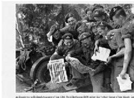
An American in the back of a tank of the 101st Airborne Division in the 'Victory' town of the Netherlands.