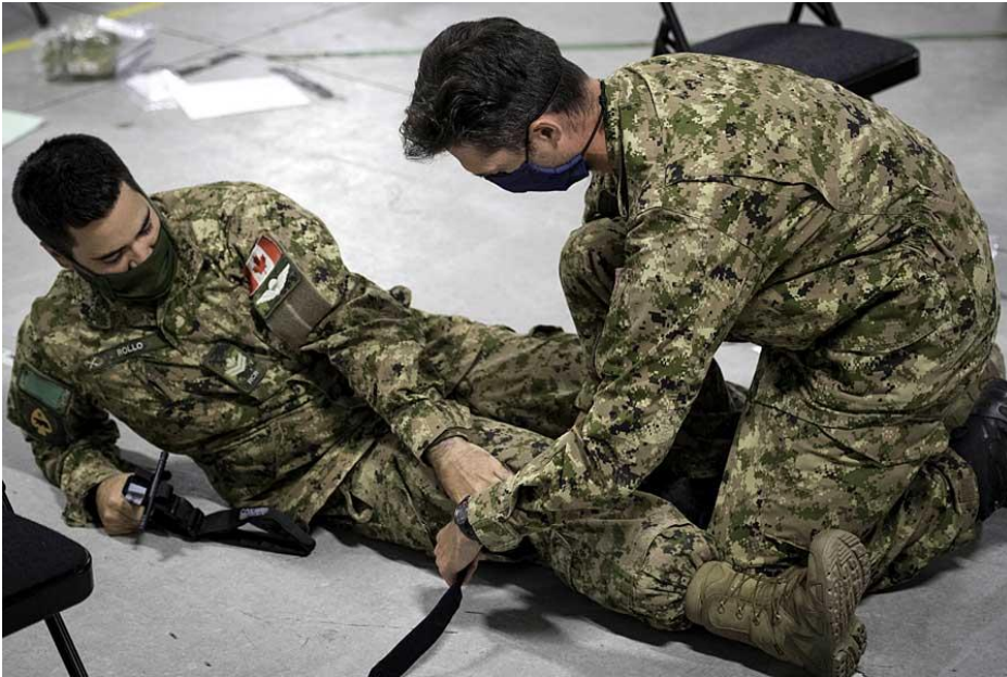
Members of Garrison Petawawa wearing four-colour CADPAT Prototype J, from which five-colour CADPAT (MT) is derived, while participating in Combat First Aid training on June 10, 2020

At the end of February 2024, the Canadian Army issued an Information Article on CADPAT Multi-Terrain (MT) Modernized Combat Uniform (MCU). Joint-Forces.com 31 Mar 2024