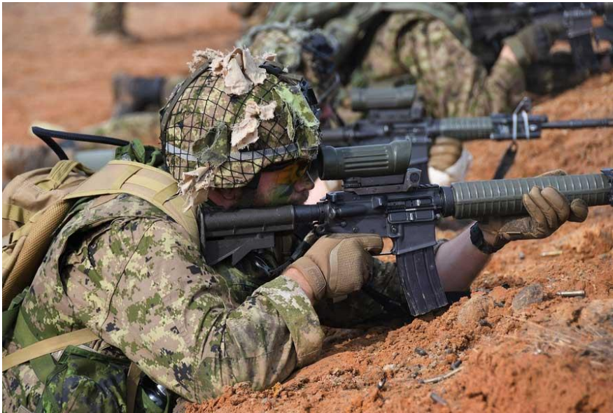
Four-colour CADPAT Prototype J during field testing in 2019

is increasingly important. CADPAT (MT) provides outstanding performance across the widest range of environments in which Canadian soldiers are likely to operate. The goal of camouflage is to delay detection by the enemy. The selection of the new Canadian Disruptive Pattern Multi-Terrain (CADPAT (MT)) colour scheme was a data-driven process, as this pattern reduces the likelihood of detection from a greater range of technologies and in the widest range possible of operational environments. Technological advances in warfighting, namely the digitization and proliferation of surveillance and sensors, mean having soldiers less detectable to the enemy is increasingly important. Defence Research and Development Canada (DRDC) developed specialized software, which takes the information from digital photographs of a wide range of operating environments, pixilates them, and then calculates the percentage of each colour and texture present in the environment to form the new Multi-Terrain or MT.