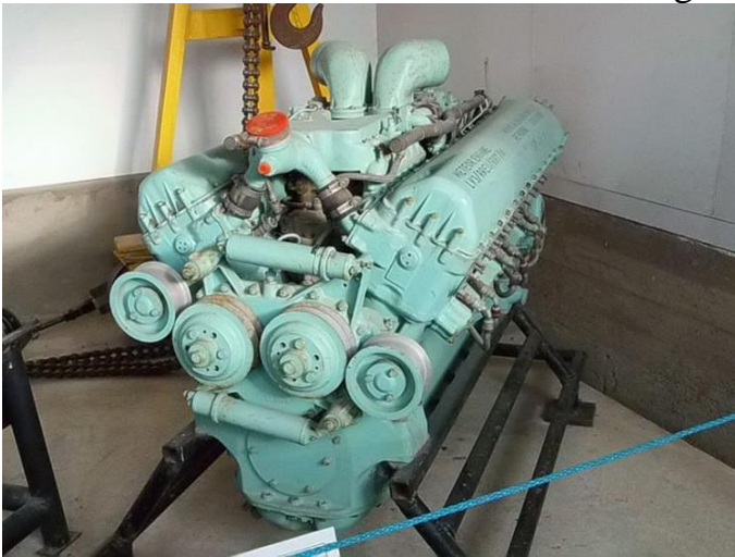
Rolls-Royce Meteor engine, ex-Comet, in eau de nil, at the Parola Tank Museum.

Cromwell was heavier than the Crusader. This was thanks to the reinforced armour which, depending on the version, reached a thickness of 3 to 4 inches (76-100 mm). However, Cromwell compensated for the increased weight with a powerful Rolls-Royce Meteor engine. This was a version of the famous Rolls-Royce Merlin aircraft engine which was installed in Lancaster, Spitfire, and many other aircraft of the Second World War period. The V-shaped 12-cylinder Meteor was one of the most reliable engines mounted on a British tank. Thanks to this engine, Cromwell can be called one of the high-speed British tanks during World War II. Engine power was up to 600 horsepower, which made it possible for tank to the maximum speed of 40 mph (64 km/h). By the time the Mk. III was being produced, the main armament consisted of a QF 6 pounder gun (57 mm). Cromwell Mk. IV and Cromwell Mk. V were armed with a 75mm QF 75 gun. Modifications of Cromwell Mk. VI and Cromwell Mk. VIII were armed with a 95-mm howitzer and belonged to the class of assault tanks.