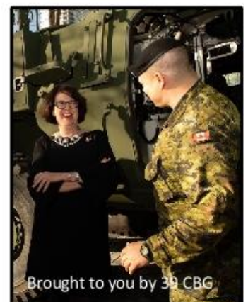
Brought to you by 39 CBG