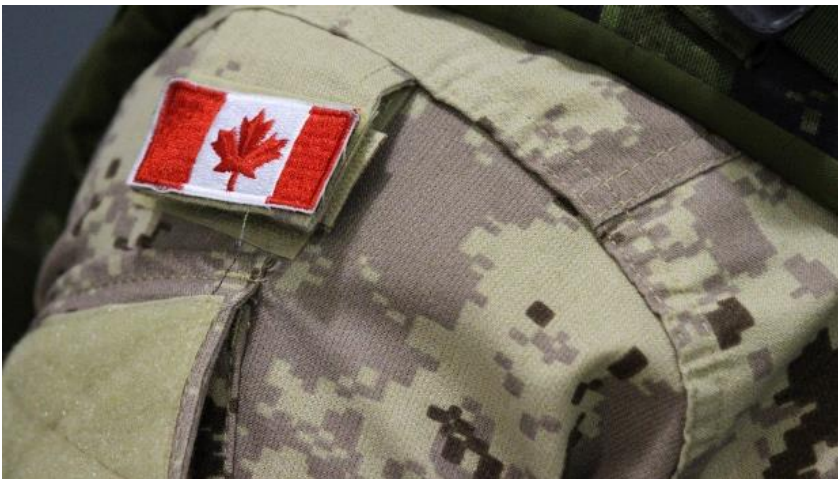
A Canadian flag on a shoulder tab of a member of the Canadian Armed Forces' CADPAT uniform in this file photo.

underspending and industry has also faced challenges in delivering on projects -- though she said it shouldn't be a surprise there have been some problems given the number of projects underway. "There are going to be some slowdowns by us," she said, adding: "If money isn't moving quite quickly enough because of a problem with a particular supply chain, a particular supplier, a contract, the way we've defined a project, we work with industry to try to resolve that." Still, Defence Minister Harjit Sajjan acknowledged to the same committee that while the government is spending more on military equipment than previous years, "we need to get enough people to be able to handle the volume of projects. We need to get better at that." Defence officials have previously blamed a shortage of procurement experts for some project delays and cost overruns. That shortage was created by successive cuts to the department starting under the Liberals in the 1990s and continued under the Conservatives earlier this decade.