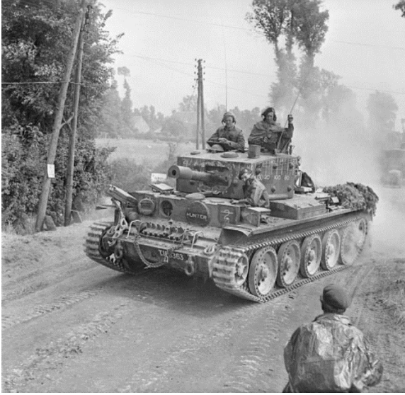
Cromwell VI with type F hull, showing driver's side-opening hatch and turret storage bins.

Canadian Army, 6 th Airborne Division and others. In Western Europe, it was given reconnaissance missions due to its high speed and low profile, which made it harder to spot.