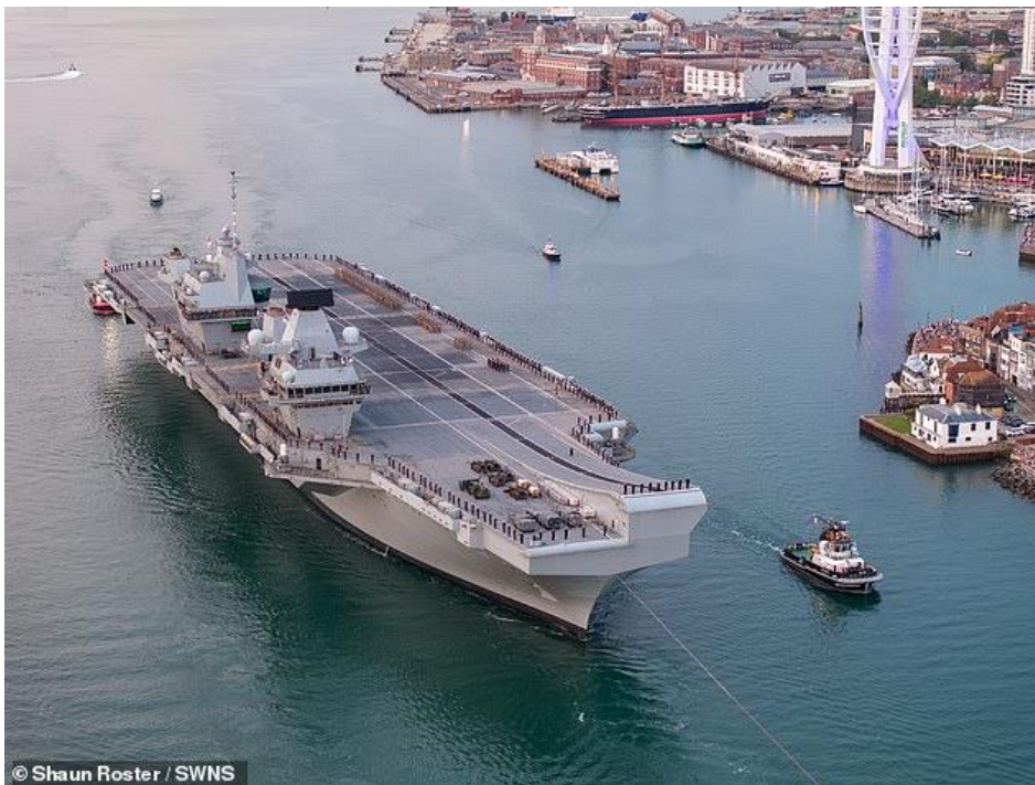
Royal Navy aircraft carrier HMS Queen Elizabeth (File Photo)