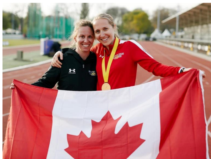
Track and Field.

Another successful iteration of the powerful Invictus Games came to a close on April 22 in The Hague, Netherlands. After two years of delay due to the COVID-19 pandemic, this year’s Invictus Games were highly anticipated amongst this year’s competitors. This year’s Team Canada comprised of 32 competitors, both serving members of the Canadian Armed Forces (CAF) and veterans, participating in a number of events, including archery, sitting volleyball, swimming, wheelchair rugby, indoor rowing, wheelchair basketball, and powerlifting.