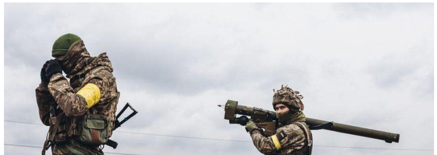
Portable anti-aircraft missiles are a key part of defending the skies

And Russia itself glorifies the sacrifices of its World War Two pilots, who were outgunned by the Germans. Some deliberately crashed into enemy planes after running out of bullets. Legends like the Ghost of Kyiv are not surprising when there are such contrasting figures given for Russian and Ukrainian losses: there is plenty of room for embellishment. On 30 April, the Ukrainian Armed Forces General Staff said that in the war so far Russia had lost 190 planes and 155 helicopters. But independent military analysts Oryx reckon the Russian losses to be 26 planes and 39 helicopters, as well as 48 drones (UAVs). Both Russia and Ukraine are very secretive about their own losses. Counting is difficult, because aircraft often crash in Russian-held territory,