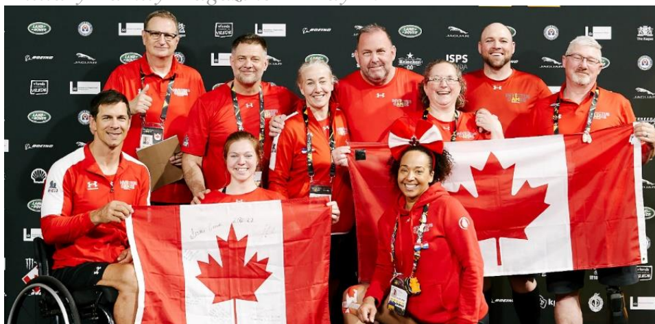
Members of the rowing team.

Another successful iteration of the powerful Invictus Games came to a close on April 22 in The Hague, Netherlands. After two years of delay due to the COVID-19 pandemic, this year’s Invictus Games were highly anticipated amongst this year’s competitors. This year’s Team Canada comprised of 32 competitors, both serving members of the Canadian Armed Forces (CAF) and veterans, participating in a number of events, including archery, sitting volleyball, swimming, wheelchair rugby, indoor rowing, wheelchair basketball, and powerlifting.