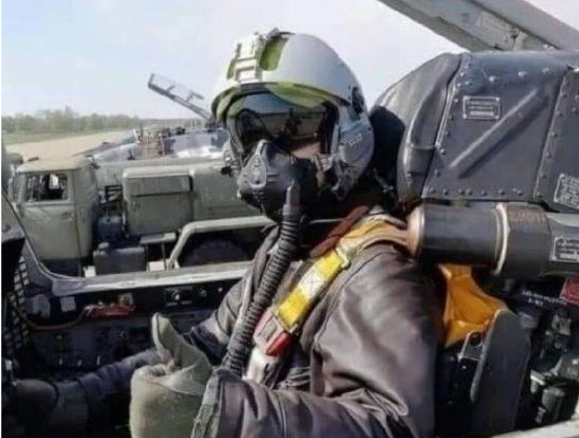
On 27 February Ukraine called the "Ghost of Kyiv" an "angel" for downing 10 Russian planes

he said. The fact that Ukrainian pilots are still denying Russia total mastery of the skies, flying inferior, older Russian-designed MiG-29s, inspired this modern legend. With all its military might, Russia has had more than two months to knock out Ukraine's air defences - and failed. The Ukrainian authorities fuelled the Ghost of Kyiv legend just days into the war. The Ukraine Security Service (SBU) showed a fighter pilot on the Telegram messaging service, with a caption calling the "Ghost of Kyiv" an "angel" for downing 10 Russian planes. But it did not name the "angel", and media reports later said the photo used was an old one.