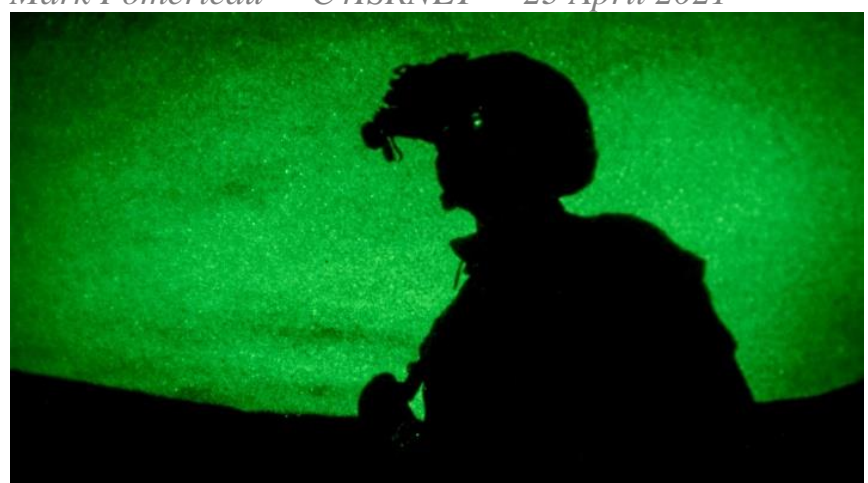
The Marine Corps sees non kinetic weapons as a less expensive alternative to traditional weapons.

WASHINGTON — Recognizing the importance electromagnetic warfare will play, the Marine Corps plans to make big investments in new systems.