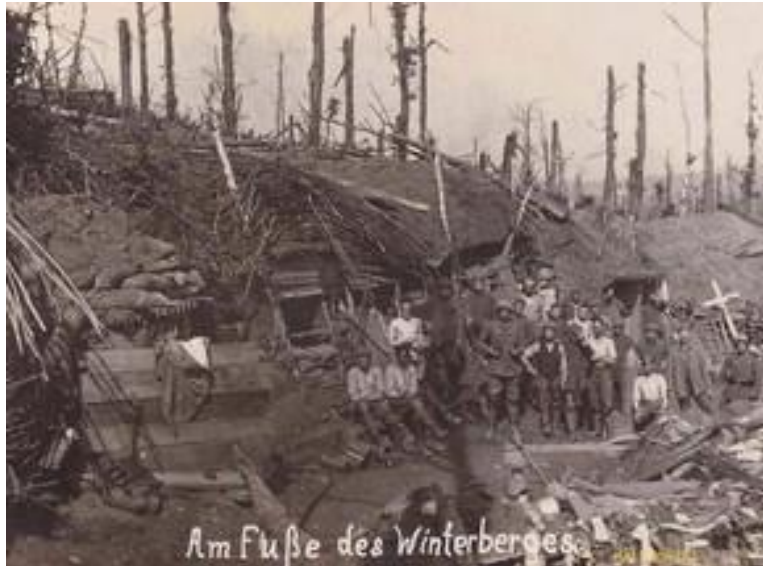
The bodies of more than 270 German soldiers from the First World War have been found where they lay for more than a century — after they died agonizing deaths. Pierre Malinowski

In a surprising irony, a tunnel built by the Germans in French territory during the First World War has been found after more than 100 years — and it's of utmost urgency that its location be kept secret. By 1917, German troops had held a hilly area some 200 km