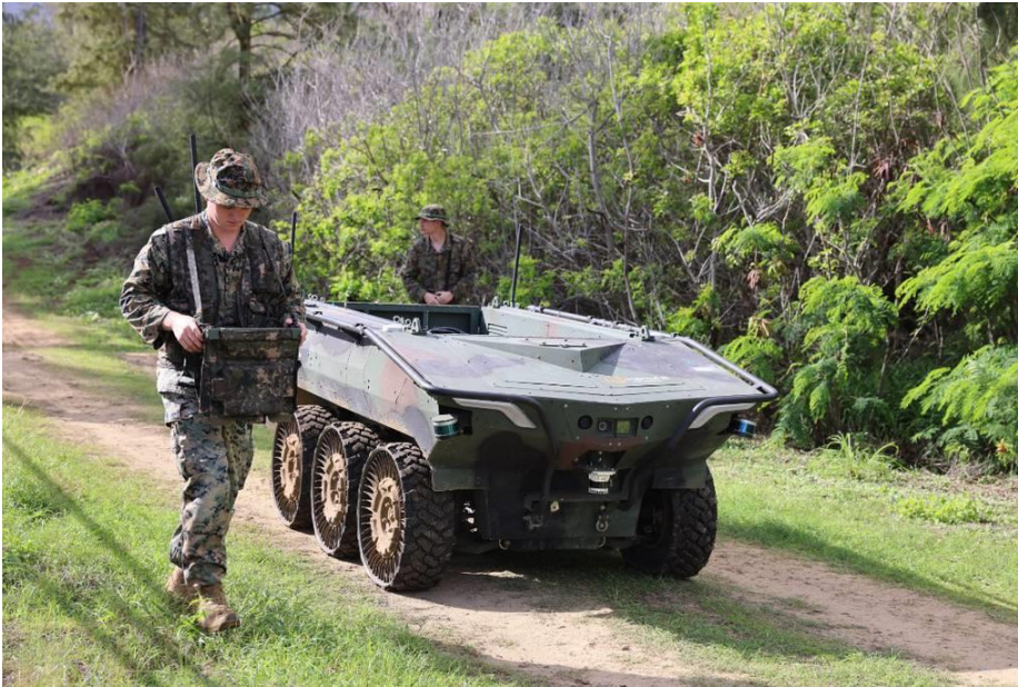
Marines from the 3 rd Littoral Logistics Battalion conducted a Foreign Comparative Test of a South Korean Unmanned Ground Vehicle, prototype in mid-December 2023 at Marine Corps Training Area Bellows, Hawaii.