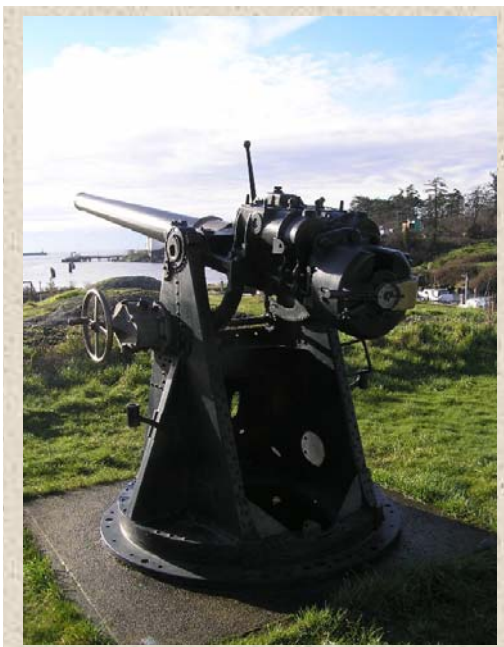
British 3-inch 20 cwt anti-aircraft gun on display at Work Point Barracks, Esquimalt.

One British 3-inch 20 cwt anti-aircraft gun. This gun is in a location overlooking Victoria Harbour from whence, for many year the artillery fired the daily time gun. It was placed here as a memorial by the Royal Canadian Artillery Association. While other guns were adapted to fire at aircraft during World War I, the 3-inch 20 cwt. was the first British gun to be designed from the start for the anti-aircraft role. Very few of these guns served in Canada and the service history of this gun is not known. (Four of them were purchased in 1938 and at the start of the war