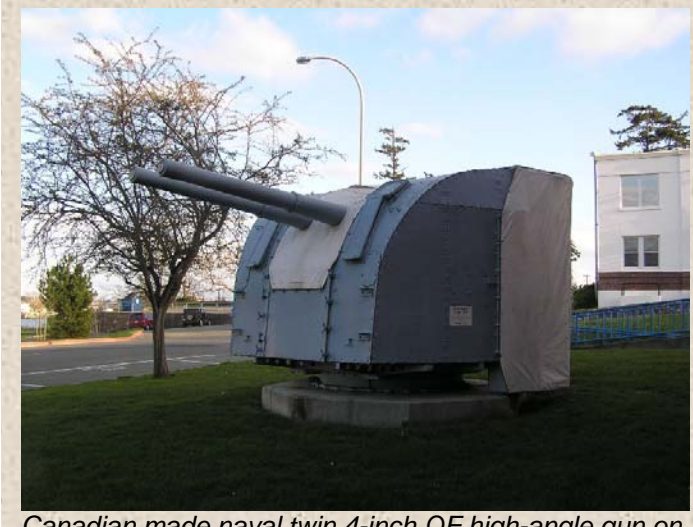
Canadian made naval twin 4-inch QF high-angle gun on display next to HMCS Venture, Work Point, Esquimalt. Photo: Parks Canada/Dale Mumford, 2005.

they were also built in Canada during World War II. With a maximum elevation of 80 degrees these guns were capable of firing in the anti-aircraft or anti-surface ship role. They were mounted on Canadian built River Class Frigates, as secondary armament on cruisers and in the post-war years they replaced the twin 4.7inch low angle guns on Canadian Tribal Class Destroyers. Although not used for coast defence on the west coast, some Twin 4- inch guns of this type were used in the coast artillery role on Canada's east coast.