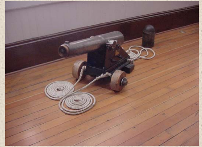
British steel 7-pounder rifled muzzle loading gun from the collection of the 5th (BC) Regiment, Royal Canadian Artillery Museum. Photo: Parks Canada/Dale Mumford, 2003.

were mounted in the Victoria-Esquimalt Defences at Duntze Head from c.1900-04.