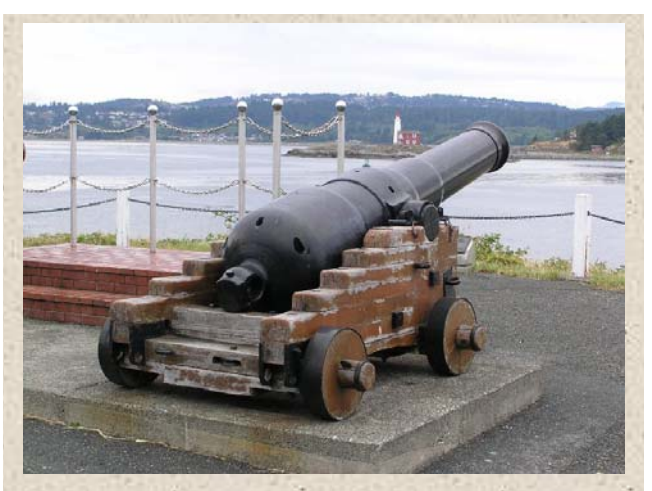
British 64-pounder 64 cwt rifled muzzle loading gun at Duntze Head, in the Dockyard, Canadian Force Base Esquimalt. Photo: Parks Canada/Dale Mumford, 2005.