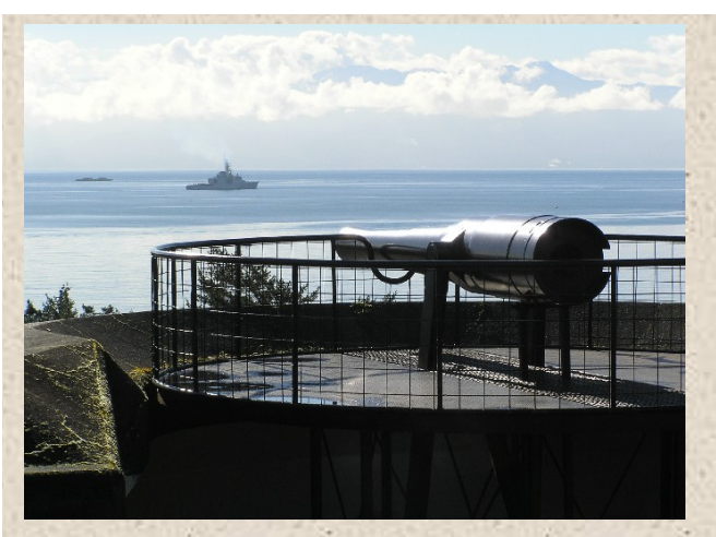
A 6-inch BL Mk6 gun in the Upper Battery, Fort Rodd Hill NHS. The gun barrel is original, but the mounting is a modern fabrication. Photo: Parks Canada/Dale Mumford, 2005.

One British 3-pounder QF Hotchkiss sub-calibre gun. This gun is displayed in the artillery store in the Lower Battery and was designed to be inserted into the breech end of a 6 inch gun barrel to allow live firing practices