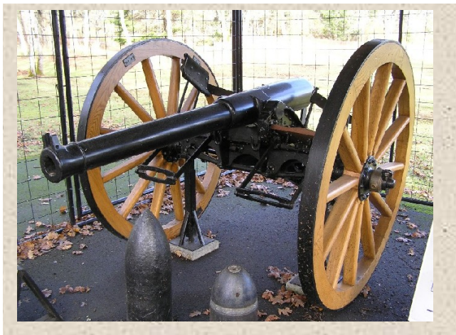
A 13-pounder rifled muzzle loading field gun on display on the grounds of Fort Rodd Hill NHS.

One British Twin 6-pounder 10 cwt gun. This gun is mounted in an emplacement designed for it and constructed in 1944 at Belmont Battery. The gun is complete, and its range finder, two spare barrels and various spare parts are displayed in the Belmont Battery artillery store. This gun, and all the other guns of this type in Canada, were removed from their batteries in 1956 and given to Norway as part of a NATO mutual aid agreement. This gun was returned by the Norwegian government in 1983.