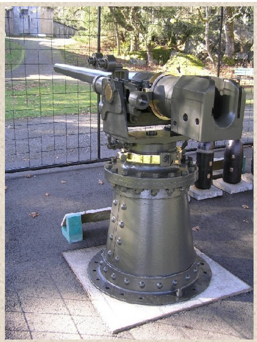
A 6-pounder QF Hotchkiss gun on display on the grounds of Fort Rodd Hill NHS.

One British 6-pounder QF Hotchkiss gun. This gun is unpainted and is complete on its garrison carriage with the breech assembly in place. While the exact history of this gun is unknown, as noted above two guns of this type