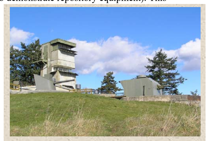
A 12-pounder QF 12 cwt gun (at left) and twin 6pounder 10 cwt gun (at right) installed in Belmont Battery, Fort Rodd Hill NHS.

to be carried out using very much cheaper ammunition.