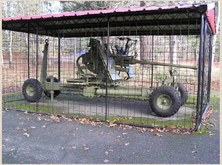
Canadian made 40 mm Bofors anti-aircraft gun, produced during World War II by the Otis Elevator Company, displayed on the grounds of Fort Rodd Hill NHS.

One Canadian made 40 mm. Bofors anti-aircraft gun. Displayed near the exit to the site, this gun is complete on its carriage and has been painted in the colours of the 27<sup>th</sup> AA Regiment, RCA, which mounted such a gun in the Lower Battery at Fort Rodd Hill in the later part of World War II. Designed by the Swedish Bofors company, the