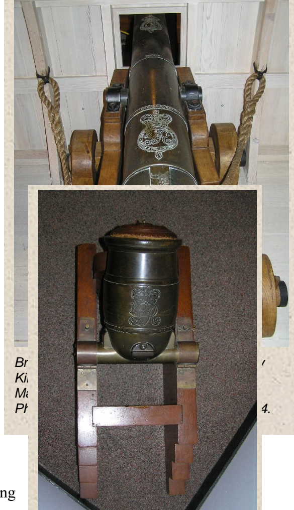
British brass Coehorn Mortar in the collection of the Maritime Museum of British Columbia. Photo: Parks Canada/Dale Mumford, 2004.