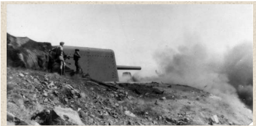
A 6-inch BL Mk 24 gun firing at Mary Hill Battery c. 1945.

The first of the modern guns ordered to complete the ultimate plan for the defences finally began arriving in Victoria in 1943. In that year three 6-inch Mk 24 guns on Mk 5 mountings replaced the older Mk. 7 guns at Mary Hill. These guns could be elevated to 45 degrees and had a maximum range of 24,500 yards (22 km). At Albert Head the 9.2-inch guns