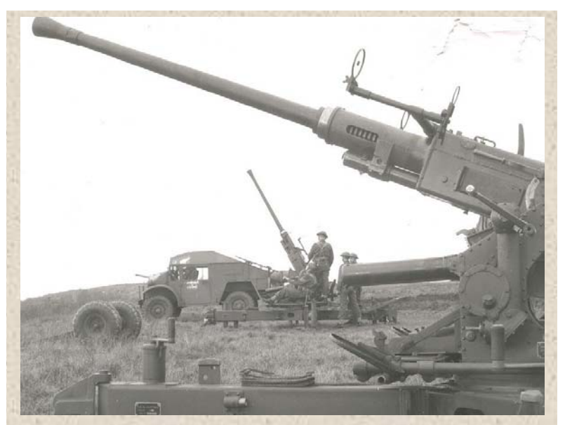
Bofors 40 mm light anti-aircraft guns with a Field Artillery Tractor on Macaulay Plain in Esquimalt during World War II.

The first Canadian made Bofors 40 mm light anti-aircraft guns arrived at Esquimalt just three days after Japan's entry into the war in December 1941. Over the following months several batteries of heavy and light anti-aircraft guns were installed to protect both Victoria- Esquimalt and the Patricia Bay military airfield (now Victoria International Airport). By October 1942, sixteen 3.7- inch QF heavy anti-aircraft guns and twenty-four 40 mm Bofors light anti-aircraft guns were in service around Victoria and Esquimalt. Many other batteries of anti-aircraft guns were installed from 1942 to 1945 to protect harbours, airfields and seaplane bases elsewhere in BC.