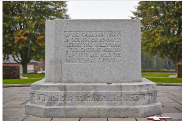
Passchendaele Canadian Monument

Have you bought your tickets for our BirthDay Party on the 1st of February? Check it out here. https://www.vancouvergunners.ca/centennial-page.html