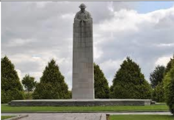
St Julien Canadian War Memorial