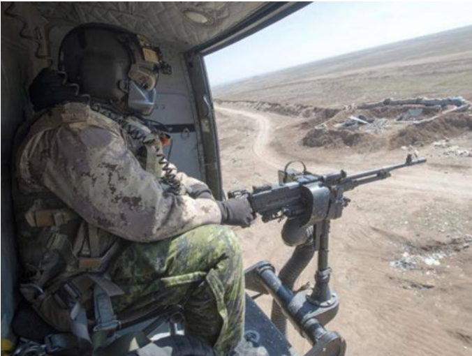
A Canadian Forces door gunner keeps watch as his Griffon helicopter goes on a mission, Feb. 20, 2017 in northern Iraq.