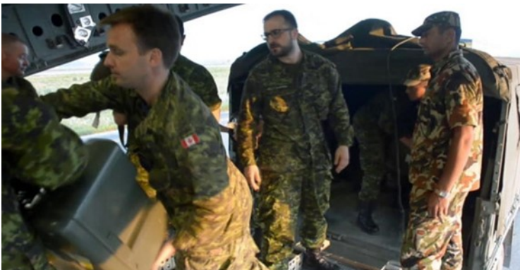
Canadian Forces Disaster Assistance Response Team (DART) team members responded to the Nepal earthquake in 2015