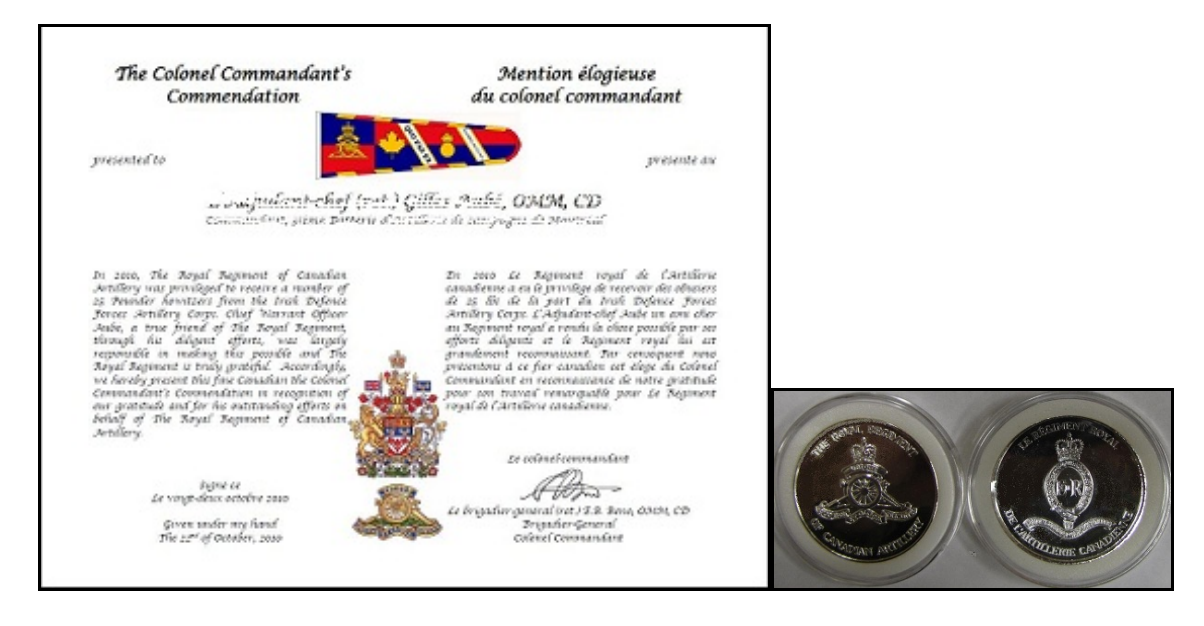
Figure 1 - Colonel Commandant's Commendation

presented. The scroll will always be signed by and, where circumstances permit, be presented personally by the Colonel Commandant. In those instances where the Colonel Commandant is not present, the scroll will be presented by a senior gunner officer in a ceremony befitting the importance of the awarding of this Commendation.