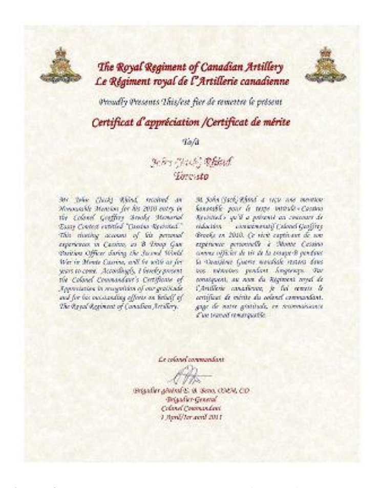
Figure 2 - Colonel Commandant's Certificate of Appreciation