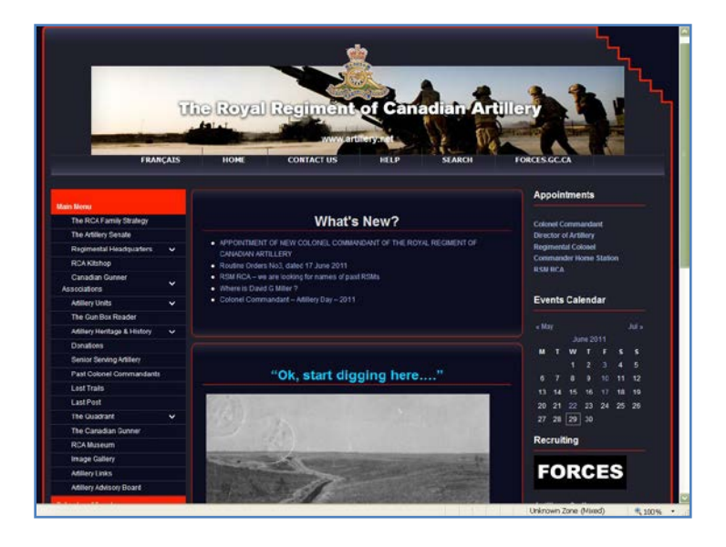
Figure 1 – Home page at canadianartillery.ca

effective to distribute in a hard copy, will be placed on the site for the benefit of The Regiment as a whole. This site is located at <a href="www.canadianartillery.ca">www.canadianartillery.ca</a> and RHQ RCA manages the website on behalf of The Royal Regiment.