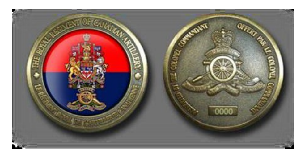
Figure 3 - Colonel Commandant's Coin

4. Presentation - The Coin will be presented by the Colonel Commandant. A formal parade is not required for the presentation.