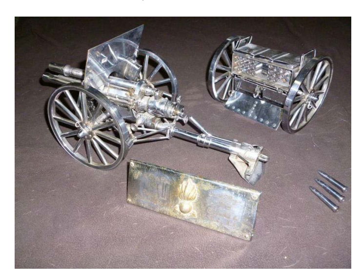
Figure 4 - RCA Sergeant of the Year Award

1. The RCA Sergeant of the Year Award is awarded annually to one Regular Force and one Reserve Force Sergeant, who demonstrate outstanding leadership that has a positive effect on The Royal Regiment of Canadian Artillery.